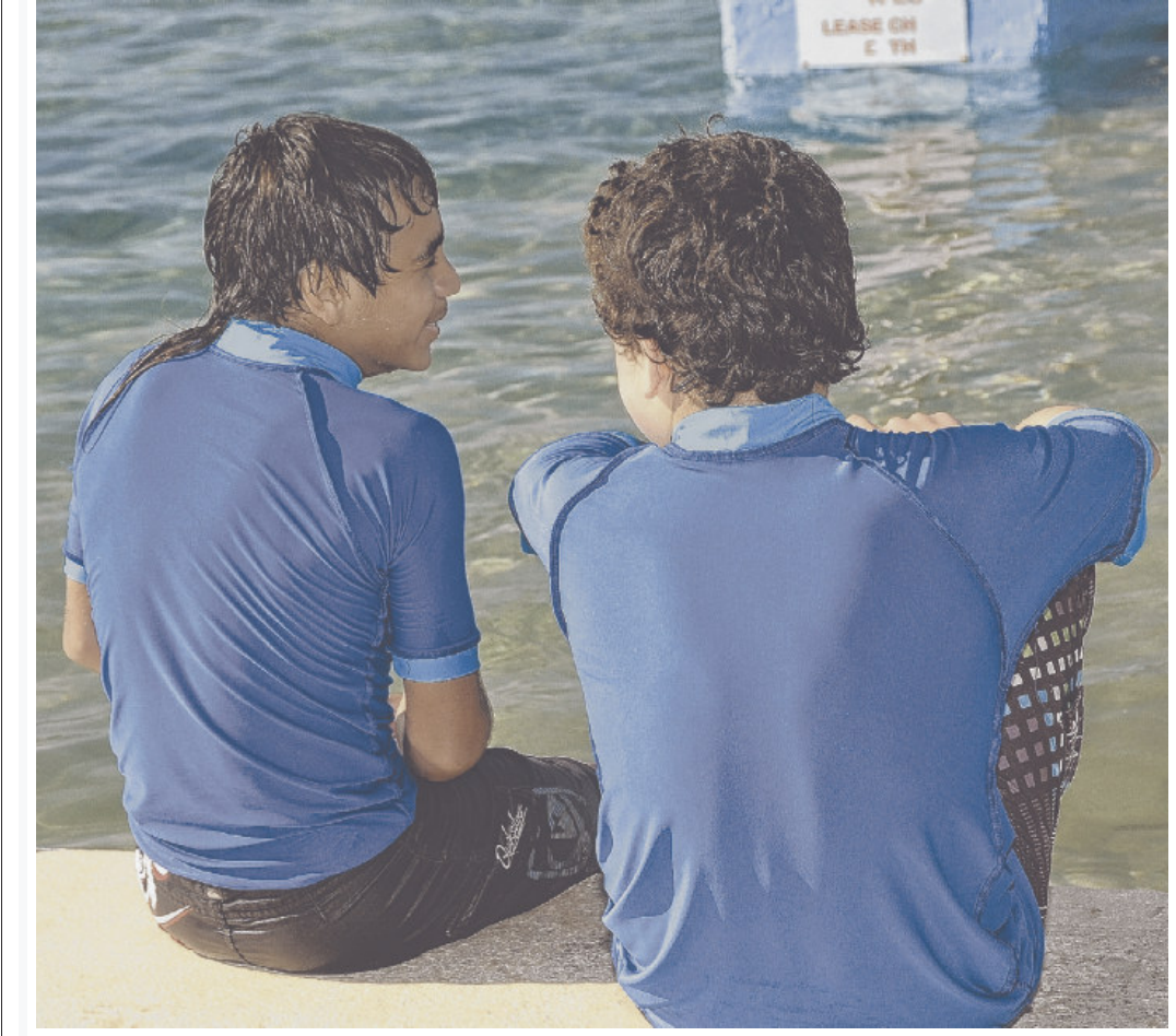
Teachers Mutual Bank has been a big supporter of Stewart House

The mutual bank has more than 155.000 members