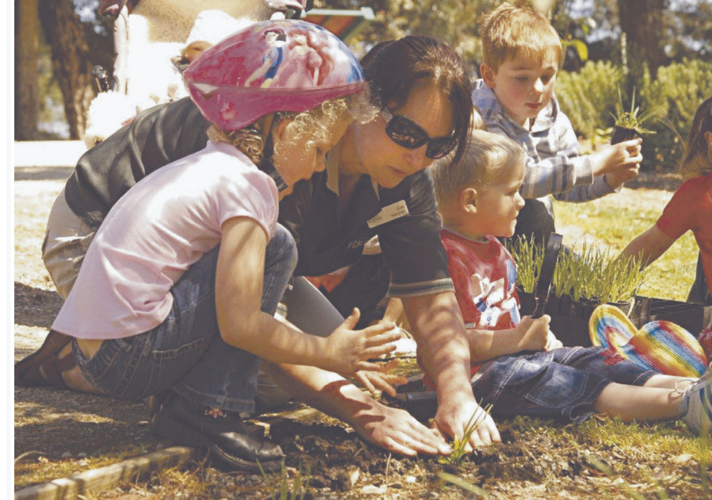
Geelong's Active in Parks was developed to promote community wellbeing through outdoor exercise in local parks and open spaces